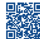
Scan this QR code to see the map of Brussels!

Studying in Brussels offers students the unique opportunity to go on some great (as well as quick and inexpensive) travels and getaways. Belgium's inter-city trains provide quick access to the Belgian seaside, Medieval Bruges, Antwerp (the diamond capital of the world), and the wooded hills of the Ardennes. Looking beyond Belgium, Brussels is the ideal base from which to visit the rest of Europe. Paris is a short 90 minutes by fast train and London, Cologne and Amsterdam are just two and a half hours away. In addition, most major European cities are two hours or less away by plane.