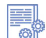
Innovative laws, policies and policy frameworks