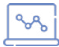
Agency in algorithmic governance