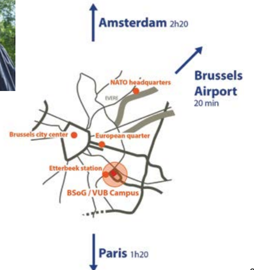
Brussels is the ideal base from which to visit the rest of Europe