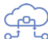
The techno-economic transition

Today's transitions entail a techno-economic element about how innovation in different sectors of our (market) economies can come about and conquer the marketplace. Our researchers also pay attention to the governance of democratic transitions, and the ensuing reconciliation of diverging societal values.