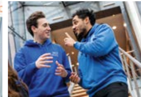
Our students visiting European institutions, enjoying the city of Brussels, and celebrating their graduation. Our alumni attending a BSoG career event.