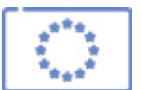
European external relations