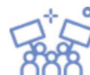
Democratic transition governance