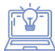
Innovation in digital research