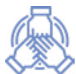
Sovereignty in a digital age

Such questions address the difficulties in leveraging new technologies to enable effective citizen participation, the growing need for continued stakeholder engagement in global, European, national and local governance, and the need for concerted regulation in the digital environment. As such, the rapid pace of technological innovation upends existing forms of governance and necessitates the development of novel approaches.