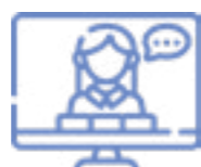
Information distrust and disorder