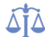
Reconciliation of values